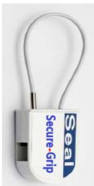
Part # SG5001W

Ready to use again and again which will save money!