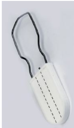
Part # SG4001W

Used to secure keys to your key management system, anti-tamper key seals come in an easy identifiable white. Designed to prevent removal of keys through a key ring, anti-tamper key seals can be fully customized with your business logo and contact details. All the while still allowing the ability to write the required key info, car registration, the hotel room number or even room location reference etc. The seals are available in packs of 100