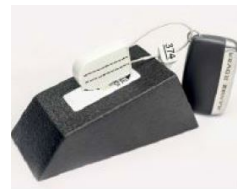
Part # SG5000B Key Seal Detacher

Package of 50 anti-tamper key seals - $599.00