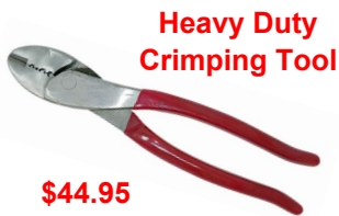
Heavy Duty Crimping Tool