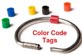
Color Code Tags