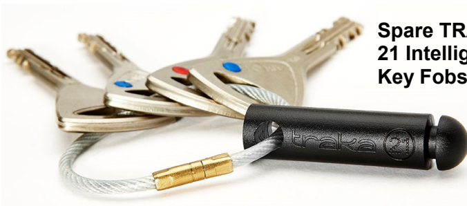
Spare TRAKA 21 Intelligent Key Fobs

Time Access offers a wide range of accessories for your key management systems Key rings, Security tamper proof key rings ( our key rings are easily fitted that require no special tools so they quickly lock the keys to the key Fobs Wide range of security key rings are available